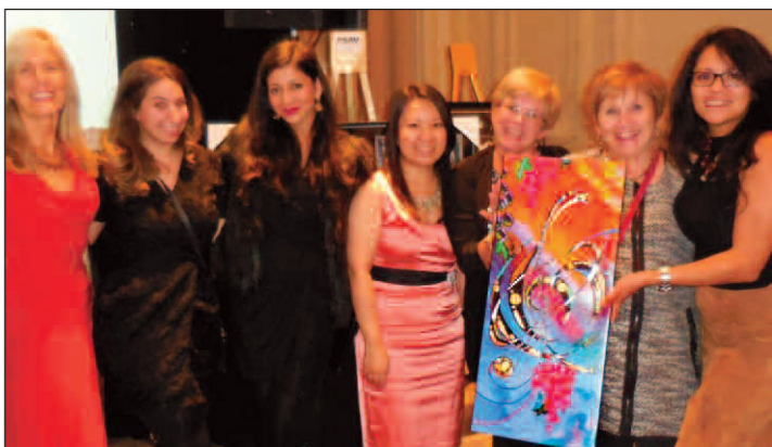
Guests enjoying the Gala & Live Auction