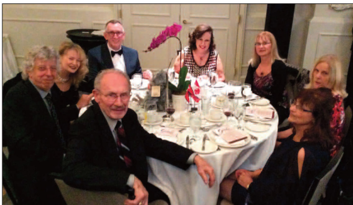
Pierre Pilote with Gala Guests