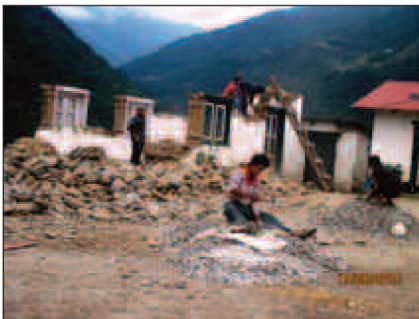
Rebuilding Phaplu Primary School

Please follow our updates on our website at http://www.thesiredmundhillaryfoundation.ca