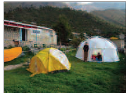
Outside Long Stay Ward at Kunde Hospital