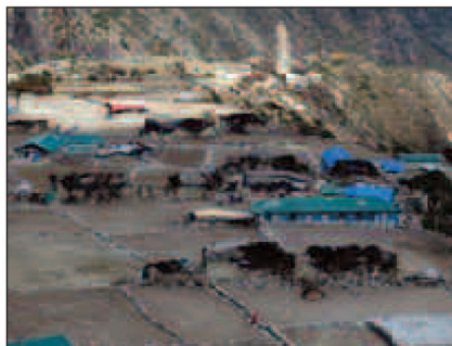
Village of Thami after the earthquakes